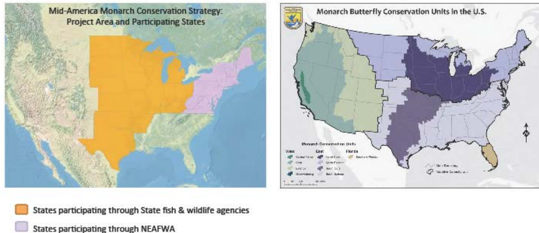
Figure 1. MAFWA Monarch Planning Geographies. Source: http://www.mafwa.org/?page_id=2347

Although MAFWA has provided important oversight and coordination, monarch planning and program delivery will happen primarily at the local and state levels. Most MAFWA states have hosted Monarch Summits and produced or are developing state monarch (or native pollinator) plans. SDGFP organized a Monarch Summit, held in Mitchell, South Dakota, in October 2017. A variety of groups representing critical partners and industries were invited to a facilitated meeting that included presentations by experts on monarch life history and conservation challenges and offered participants the opportunity to brainstorm strategies to jumpstart the more formal state monarch planning effort (Appendix A). The South Dakota Monarch Conservation and Management Plan provides a strategic framework that will transition to an implementation plan where partners can contribute to completing specific tasks and fulfilling commitments. Input gathered during the South Dakota Monarch Summit will continue to provide valuable information for planning and implementation.