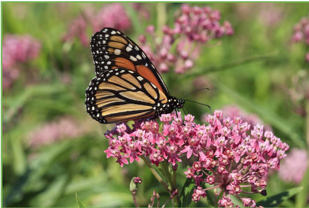
Monarch adult on swamp milkweed

South Dakota Department of Game, Fish and Parks Pierre, South Dakota November 2018