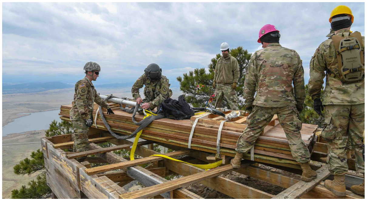
Bear Butte Trail System

Each project that is selected for funding is required by the FHWA and GF&P to hire an archeologist to complete a Level III Archeological Survey of the project site. A copy of the completed report will need to be submitted to this office. We will forward this report to FHWA for their approval. You should plan to include $3,500 in your project proposal to cover your expense of hiring an archeologist and having the report completed. No earth disturbing activities may be conducted until the Game, Fish and Parks Department informs you that these clearances have been secured. In some cases it may take several months to secure the needed clearances. A Social, Economic and Environmental Impact Form is provided as part of the application packet and must be completed by all project applicants.