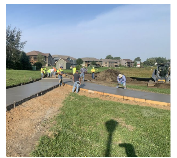
Crooks Trail System

The RTP encourages all kinds of trail enthusiasts to work together to provide a variety of recreational trail opportunities. In South Dakota, the Department of Game, Fish and Parks administers the RTP with guidance from the RTP Advisory Council.