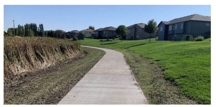
Crooks Trail System

This category broadly authorizes any kind of trail maintenance, restoration, rehabilitation, or relocation, including trail bridges and signs.