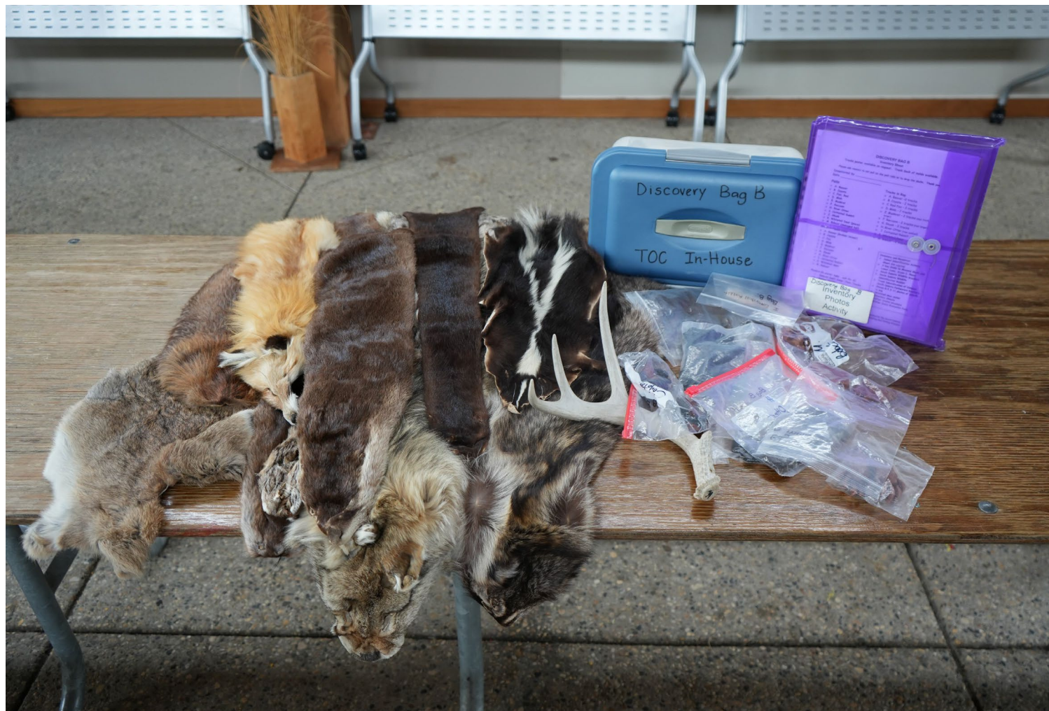
Discovery Bag B