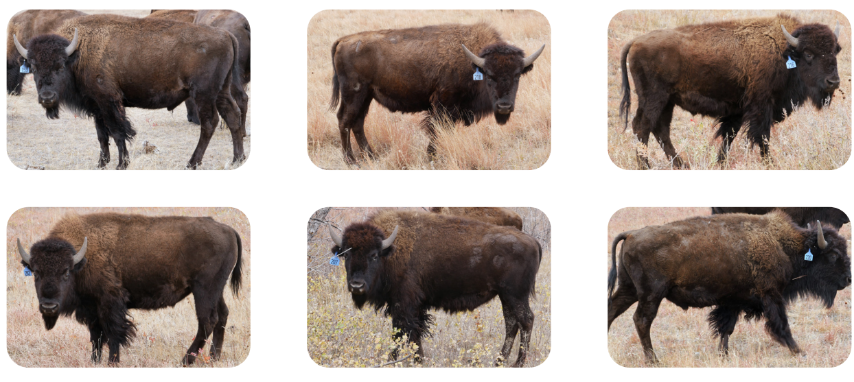
2021 Yearling Bulls Yearling bulls weight ranges from 590 to 816 pounds.