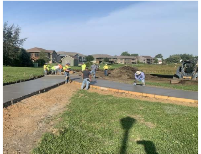
Crooks Trail System

The RTP encourages all kinds of trail enthusiasts to work together to provide a variety of recreational trail opportunities. In South Dakota, the Department of Game, Fish and Parks administers the RTP with guidance from the RTP Advisory Council.