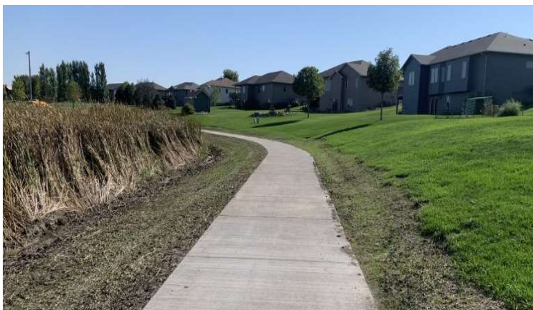
Crooks Trail System

Each project that is selected for funding is required by the FHWA and GF&P to hire an archeologist to complete a Level III Archeological Survey of the project site. A copy of the completed report will need to be submitted to this office. We will forward this report to FHWA for their approval. You should plan to include $3,000 in your project proposal to cover your expense of hiring an archeologist and having the report completed. No earth disturbing activities may be conducted until the Game, Fish and Parks Department informs you that these clearances have been secured. In some cases it may take several months to secure the needed clearances. A Social, Economic and Environmental Impact Form is provided as part of the application packet and must be completed by all project applicants.