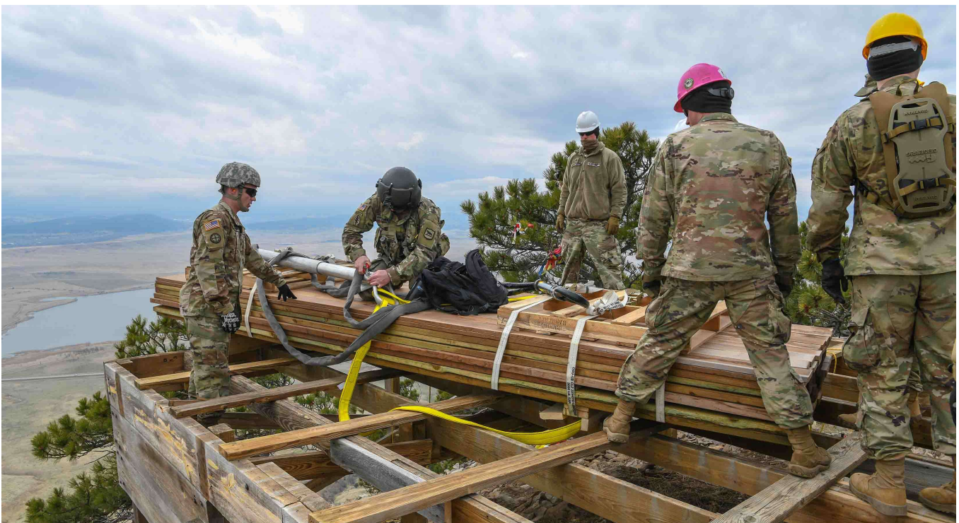
Bear Butte Trail System

Applications will be scored on completeness of the application packet. A letter of intent is required for a complete application. The Recreational Trails Program Advisory Council will score and rank the project applications based on the Evaluation Form found at the end of this RTP Application Manual.