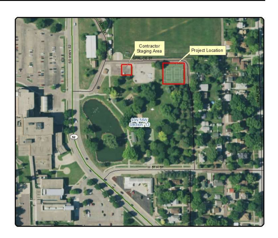
Yankton Westside Park Pickleball Court Conversion S13 T093N R56W

The location map will illustrate where the site is located within the city or county. This should be a map of the complete city or, if not located within the city limits, it must be of the entire area. Streets should be labeled and the site indicated and labeled on each location map. The staging area contractors will be able to use to complete the project should be identified on the map. A sample site location map is included as Attachment 6 of this booklet. Include three copies of the map with your application.