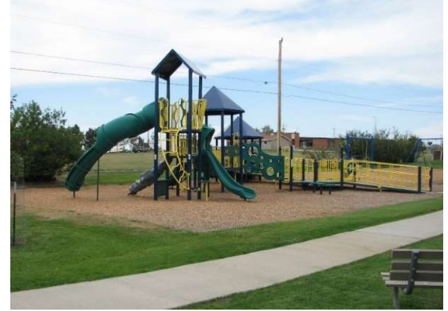
Belle Fourche, SD