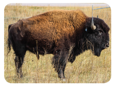
2017 Two Year Old Grade Bulls

Failed breeding soundness evaluation. Grade bulls have been semen and brucellosis tested. Weights range from 975 pounds to 1,115 pounds.