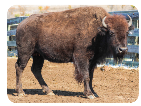
Open Heifers and Cows No shots administered, so there will be no withdrawal period.