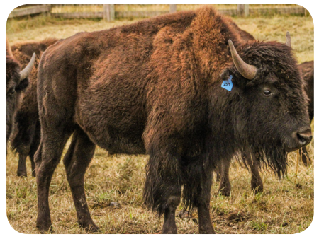
2018 Yearling Bulls Yearling bulls weight ranges from 520 to 795 pounds.