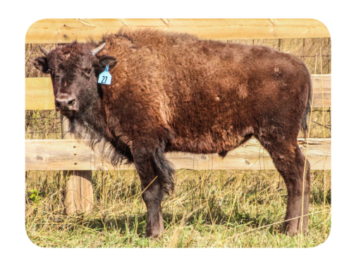
2019 Bull Calves, weaned the second week of October.

All calves preconditioned with Vision 7 20/20, Pyramid 5+ Response and Cydectin pour on dewormer. Calf weights range from 292 to 474 pounds.