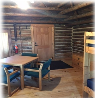
Back wall facing the door