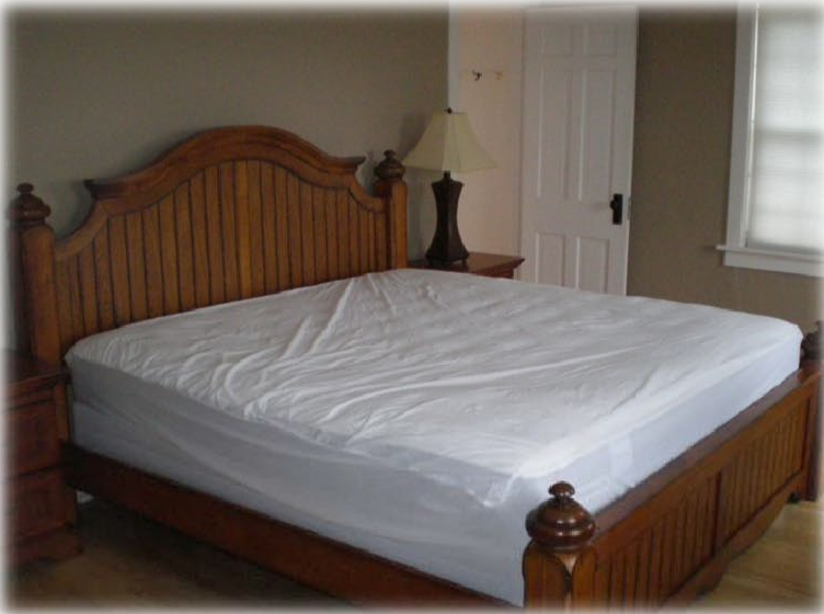
Elegant and cozy all in one!