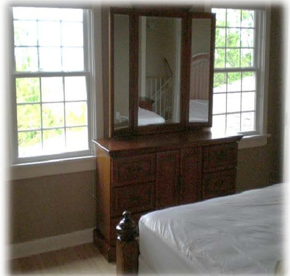
Spacious with stunning views!