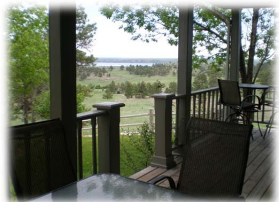
View from Lodge Front Porch