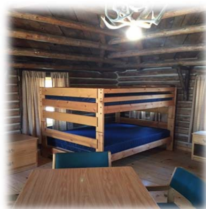
Left wall to open door