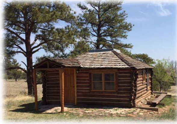
The Sheps Canyon Bunkhouse

The Bunkhouse is a very unique addition to the lodge. This full log structure was first used as a schoolhouse, since then we have restored and converted it into a sleeping quarter. Located a short walk away from the lodge, the bunkhouse sleeps four and includes 2 bunks (full/full), a dresser, and a card table. The bunkhouse has lighting and heating, but does not have a bathroom or indoor plumbing.