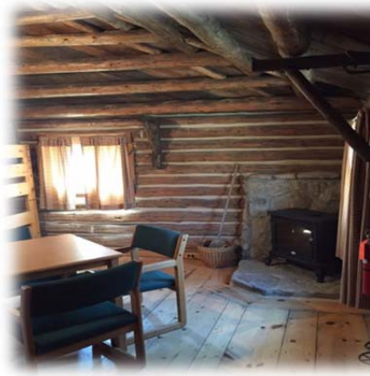
Right wall to open door