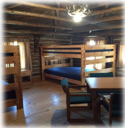
View when you open the door