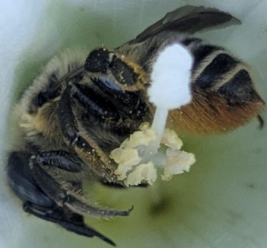
2nd Place Insects Tanya Bjerke

All photography entries are displayed on a TV inside the visitor center