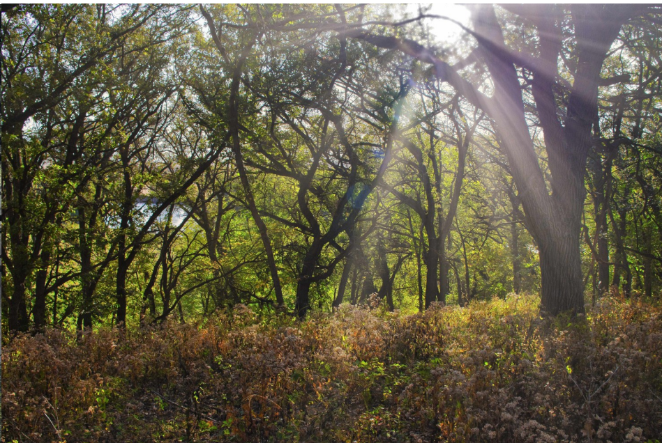
2nd Place Forrest Linsey Duffy