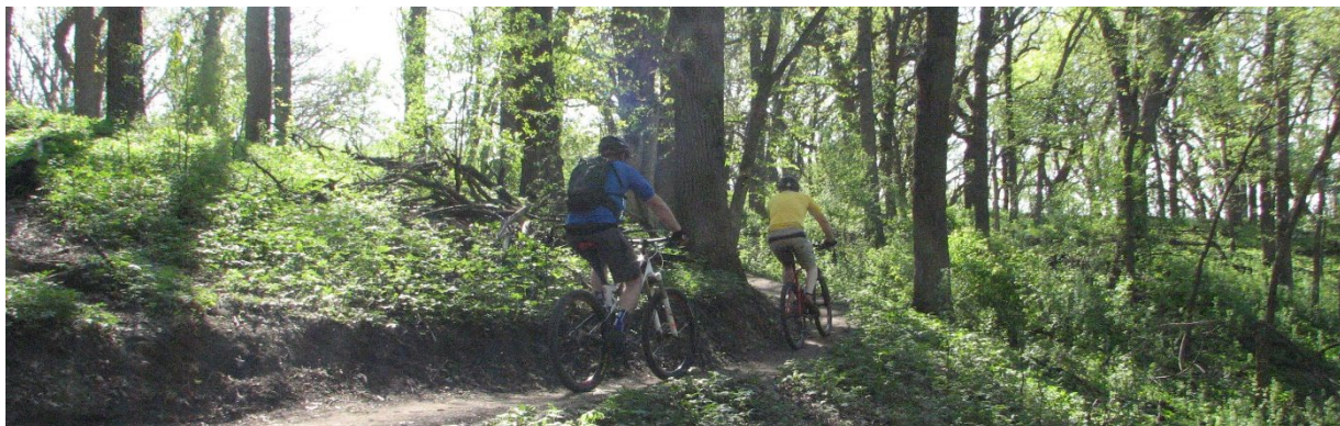
Tuthill Park in Sioux Falls

Complete the source of funding worksheet. Provide a narrative regarding donated labor, materials, equipment and land or property that is included in your match. Be sure to include information such as who is donating the time, materials or equipment, the number of hours and what kinds of material or equipment is being donated. Matching funds plus RTP funds should add up to the total project cost. Be sure to include $3,500 in your total project cost for environmental and cultural clearances.