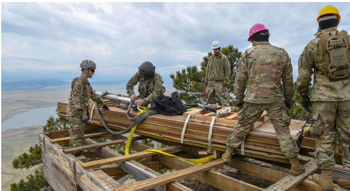
Bear Butte Trail System

Each project that is selected for funding is required by the FHWA and GF&P to hire an archeologist to complete a Level III Archeological Survey of the project site. A copy of the completed report will need to be submitted to this office. We will forward this report to FHWA for their approval. You should plan to include $3,500 in your project proposal to cover your expense of hiring an archeologist and having the report completed. No earth disturbing activities may be conducted until the Game, Fish and Parks Department informs you that these clearances have been secured. In some cases it may take several months to secure the needed clearances. A Social, Economic and Environmental Impact Form is provided as part of the application packet and must be completed by all project applicants.