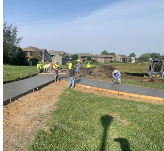
Crooks Trail System

The RTP encourages all kinds of trail enthusiasts to work together to provide a variety of recreational trail opportunities. In South Dakota, the Department of Game, Fish and Parks administers the RTP with guidance from the RTP Advisory Council.