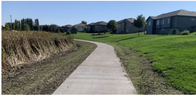
Crooks Trail System

This category broadly authorizes any kind of trail maintenance, restoration, rehabilitation, or relocation, including trail bridges and signs.