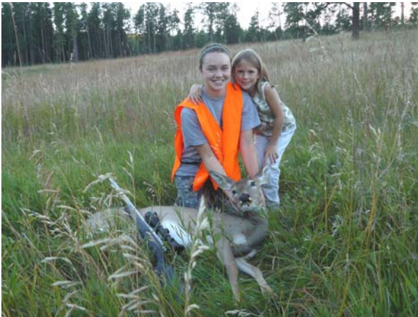
The Volunteer Hunter Access Program is a great way for landowners to get help with overabundant wildlife.

As fall quickly approaches, many people begin to think about their favorite past-time; hunting. Whether it's sitting in a goose blind watching a flock of Canada geese work, walking a shelter-belt or cornfield for deer, or reflecting on the crop damage that occurred earlier in the year by wildlife, hunters and landowners can often use more tools for communication. The Volunteer Hunter Program (VHP) is a new tool on the GFP website that is designed to connect landowners that have an overabundance of deer, geese, turkeys, and other wildlife species with hunters that wish to access private land.