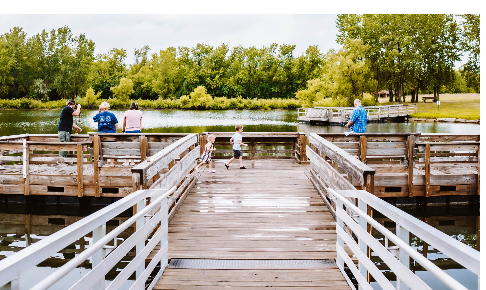
South Dakota Game, Fish and Parks serves and connects people and families to the outdoors through effective management of our state's parks, fisheries, and wildlife resources.